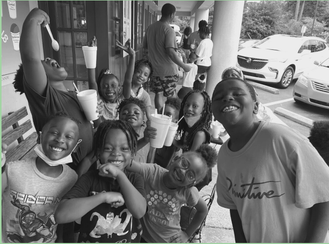
Enjoying snow cones from Nandy's Candy