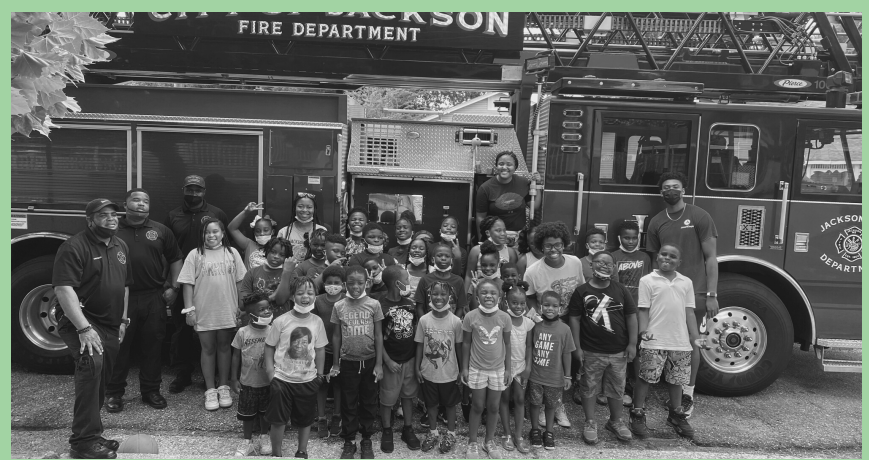
Learning fire safety from JFD