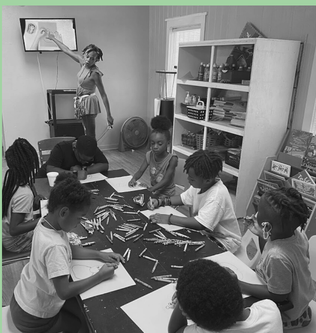
Getting creative in art class