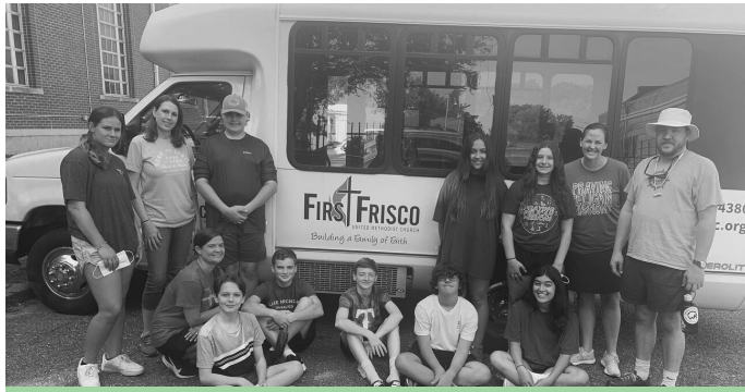
First Frisco United Methodist Church Youth Group