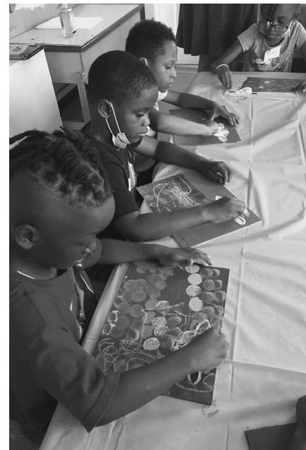
Stewspot Kids visiting Fondren Presbyterian's VBS

See what great things we can do, what lives we can lift, when we do it together?