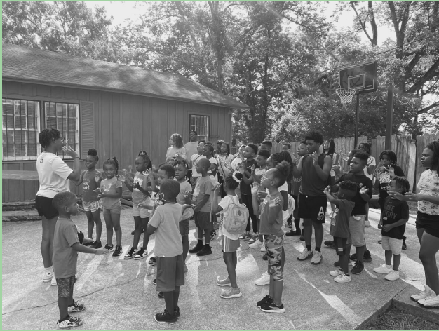
Singing songs outside the Hut