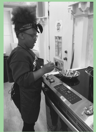
Cooking class in the Teen Center