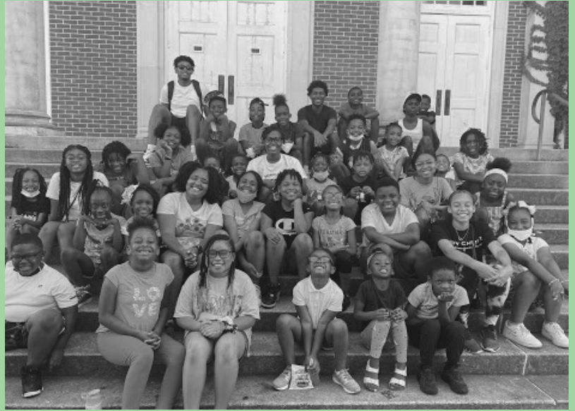
Lots of smiles on the steps at Stewspot