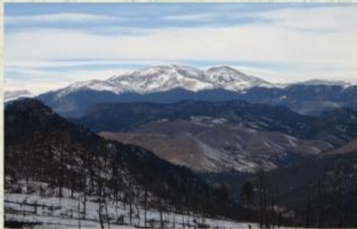
MT. BLUE SKY