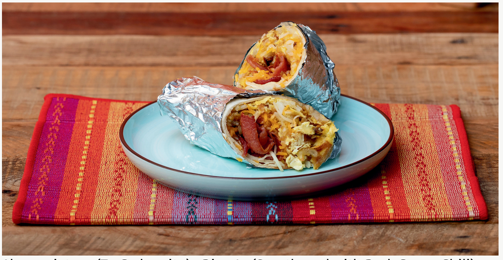
Above picture (To Go burrito) - Dine In (Smothered with Pork Green Chili)