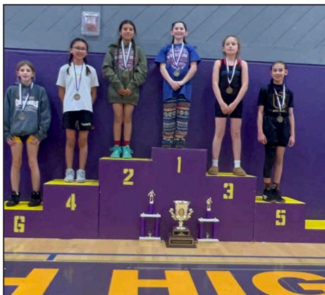
The top finishers lined up on the podium with their trophies at the end of the competition.