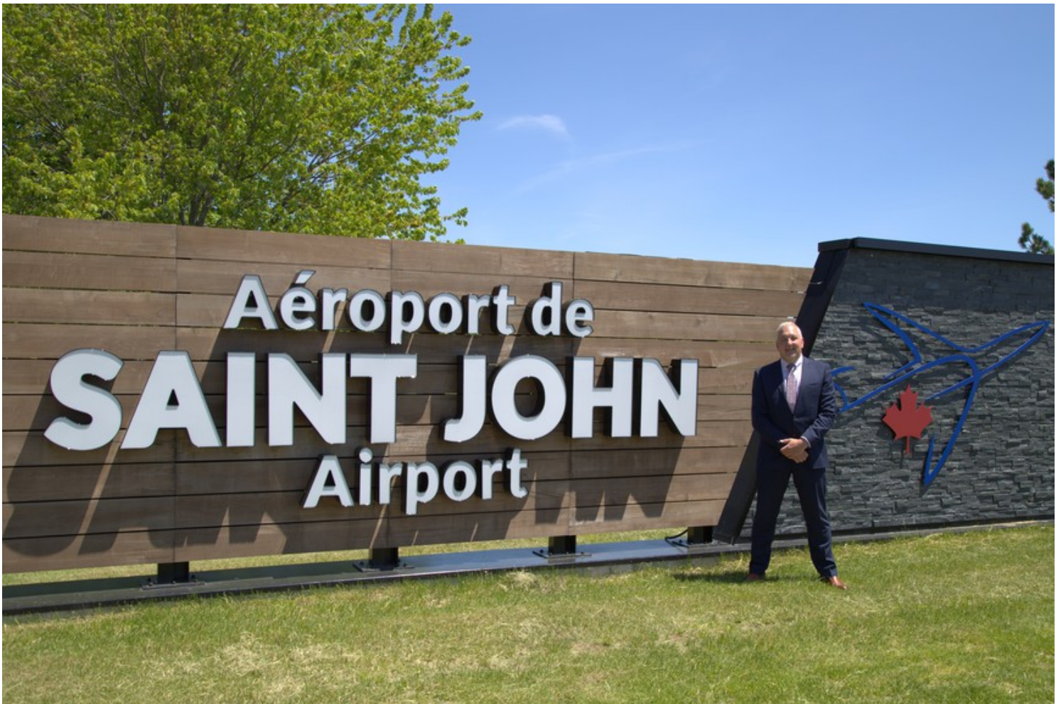
A new taskforce has been established to attract federal help for Saint John Airport.