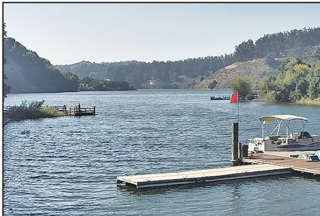
The East Bay Regional Parks closed its visitors centers but the trails are open for hiking throughout the park district.

The East Bay Regional Parks District just reminds visitors to bring their own water and hand sanitizer. The park district's closed facilities will remain closed until April 12.