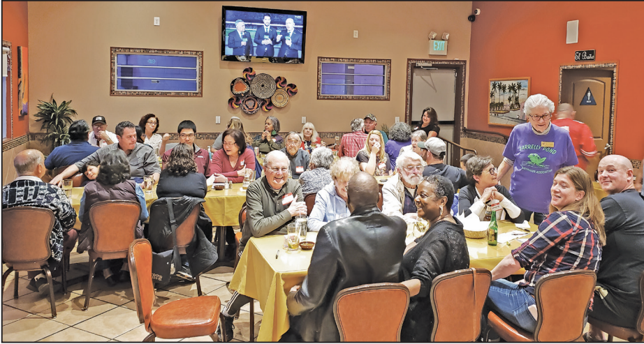
Farrelly Pond neighbors came together to connect with each other and share their experiences working in the association.