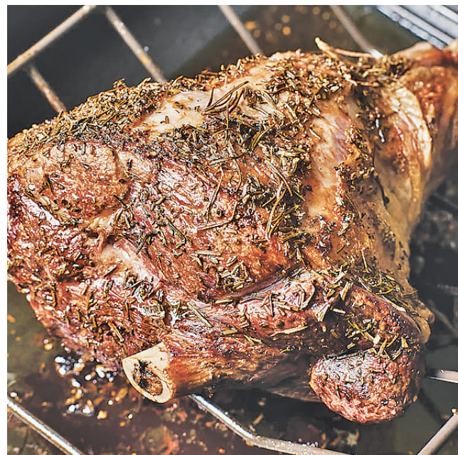
A roast Leg of Lamb is budget-friendly.

Combine sugar with 1/4 cup of balsamic vinegar and 1 tablespoon of white wine vinegar in a small nonreactive saucepan with 1/4 cup water. Heat over medium-low heat until the sugar dissolves, 2 to 3 minutes. Pour over mint and toss well. Taste and add more sugar or vinegar as needed.