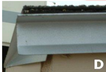
Drip Edged & Hardware

(insert images dripedge.jpg, latchoutside.jpg, shingles-brochure.jpg found in WC Files/Cx Files/Standard Features folder)