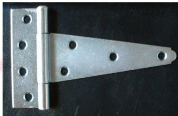
Heavy Duty Door Hinge

Rust free DRIP EDGE (D) protects wood against water damage, see additional Hardware listed below.