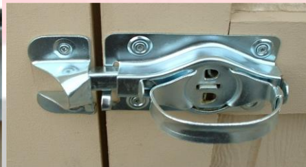
Whitcomb Steel Door Latch Brought to you by Albany Hardware

We only use the best materials from the ground up and our siding is no exception. PREMIUM ½" SIDING (B) provides exceptional strength and durability and comes standard with 7 or 8 ft sidewalls. The hardboard finish is guaranteed not to crack, split, or check and will maintain its good looks for decades.