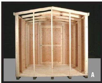
Exclusive Flooring System

We offer an EXCLUSIVE FLOOR SYSTEM (A) Our 4X4 runners are rated for GROUND and FRESH WATER CONTACT. These timbers have a limited lifetime warranty that protects your building against termites and ground rot. Strong \frac{3}{4} " plywood is nailed on top of the runners to ensure maximum load strength and durability. This unique floor system is open at both ends for additional ventilation, which guarantees that your ORIGINAL SHED can safely rest in your backyard for years to come. The superior floor design allows your ORIGINAL SHED to be moveable.