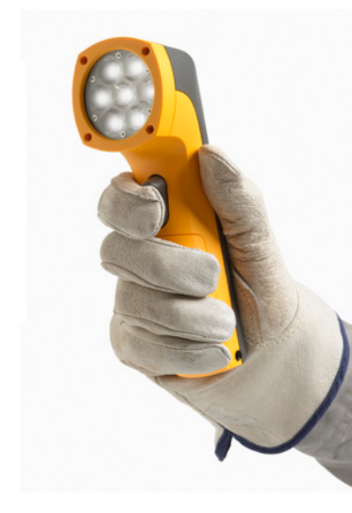
Fluke. Keeping your world up and running.®

CENTERLINE Inc. 513 E. Wisconsin Avenue Appleton, WI 54911 Phone: 920 730-0615 Fax: 920 730-0622 info@ctrline.net ctrline.net