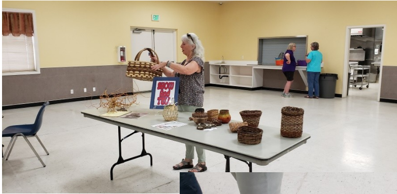
June Meeting and show and tell