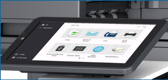
10.1" MULTI-TOUCH COLOUR USER INTERFACE