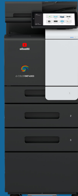
CONFIGURATION WITH TWO DRAWERS AND A COPY DESK