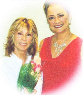
Juice Newton & Carol Curtis

Tickets go on sale July 1, 2009 at www.showboxoffice.com !! There is a promotion video on YOUTUBE linked to the JNFC website with all the details. Come and see Juice and help us raise funds for research and hopefully a cure!!