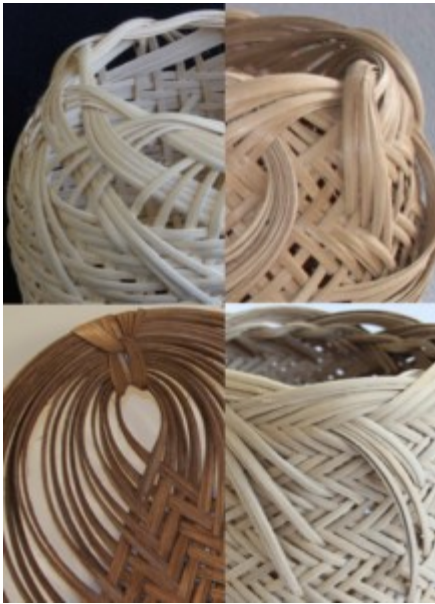
Neolithic and Japanese styles by Flo Hoppe