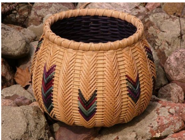
From the Internet