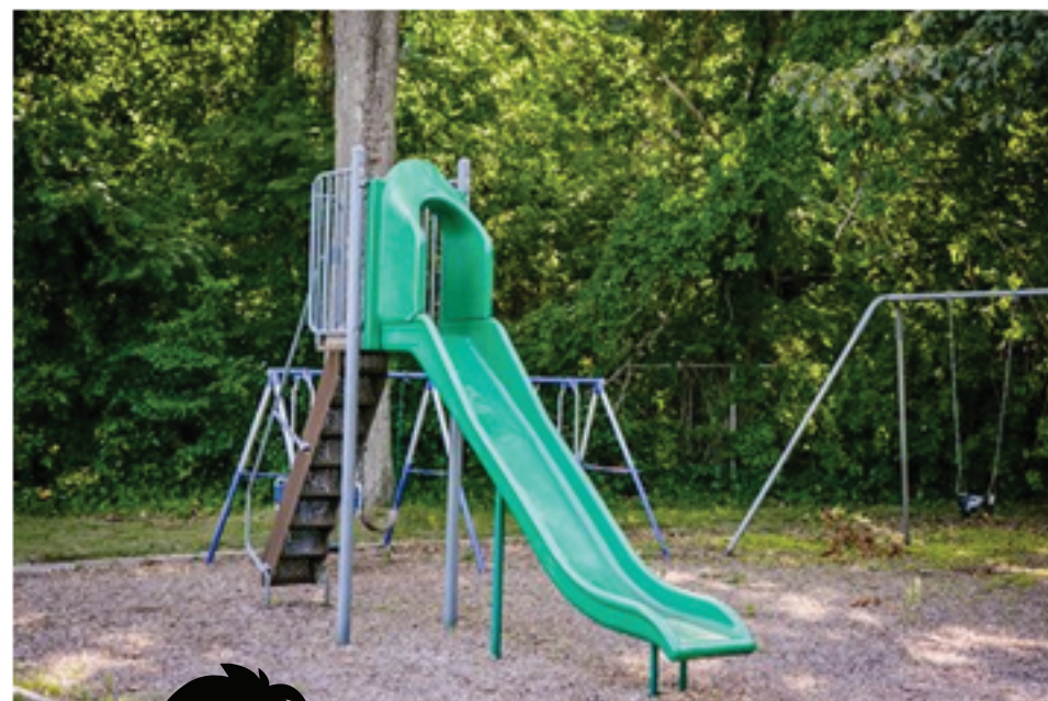
"Babe" Gauthier Park - Glasgo Road in Griswold