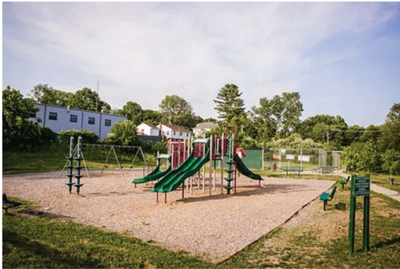
PTO Dedicated Playground at JCLL Complex