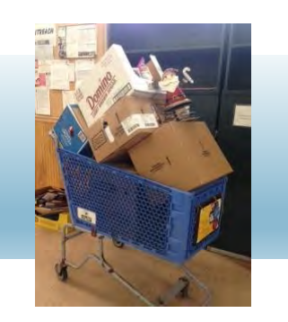
Pick up a few extra items to donate and make a less fortunate family's week!