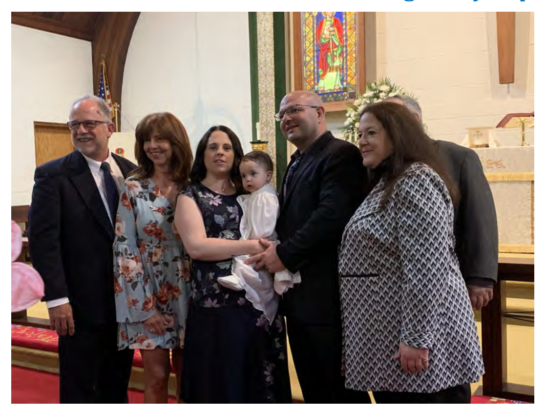
Baptized into the Body of Christ on Sunday, May 5