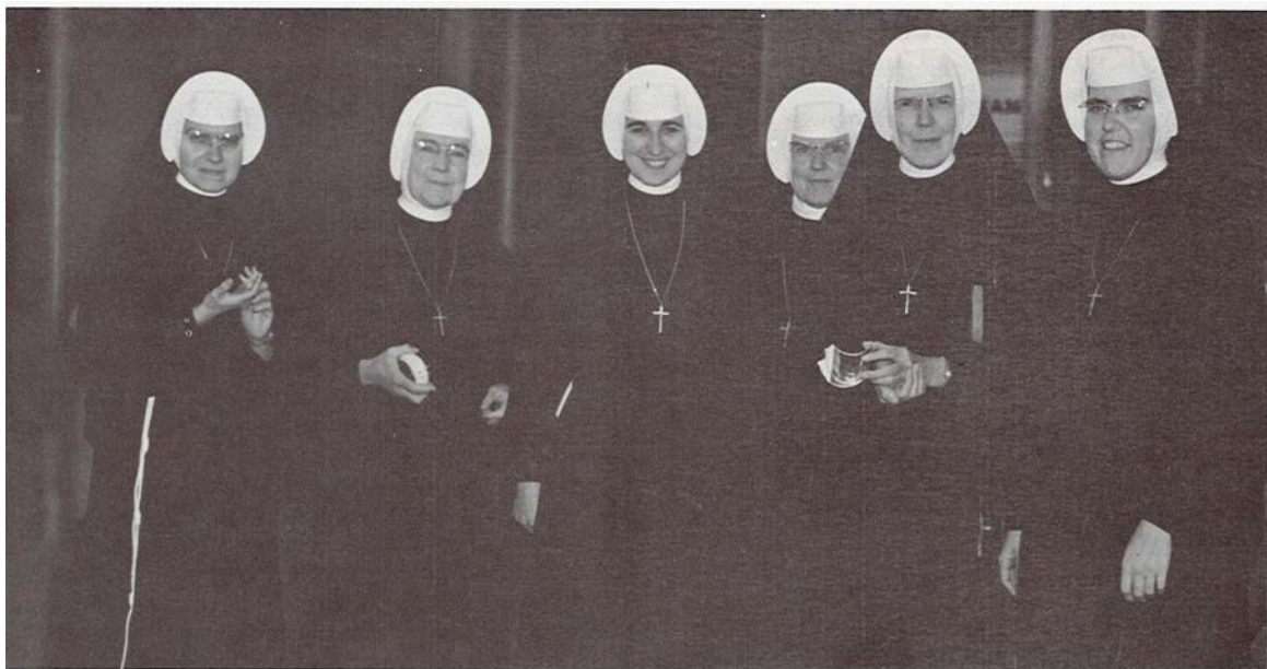
First Sisters at Our Saint Catherine's Grade School

In 2018, a new Fine Arts Building was completed to house the vibrant music program and the Arts program. Also, a new conference room is adjacent to the building. The building was dedicated to the Sisters of St. Francis , who dedicated their life into ministering and educating the students.