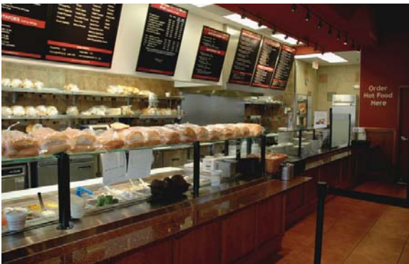
Cafeterias / Delis