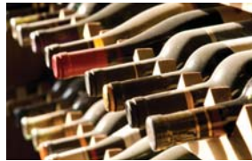
Pizza / Table Service / Quick Service / Liquor Stores