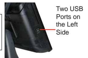
Two USB Ports on the Left Side

All product and company names are trademarks, service marks or registered trademarks of their respective owners. All features and specifications are subject to change without notice.