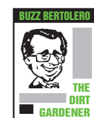
By Buzz Bertolero The Dirt Gardener

Will I harm next year's crop of grapes by cutting back old,