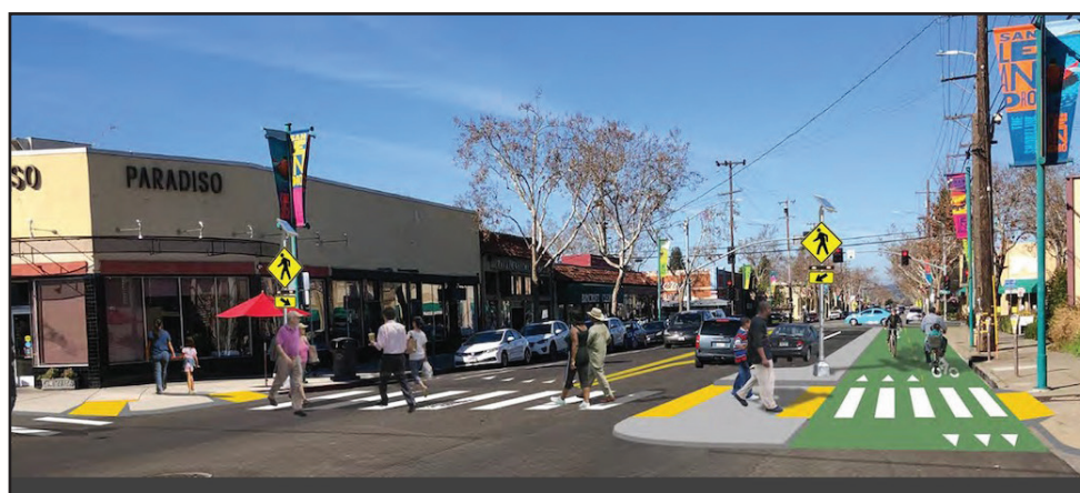
ILLUSTRATION: CITY OF SAN LEANDRO

The city will begin to seek grants next year to fund the project. The design phase is expected to begin in 2024 with any associated construction beginning in 2025.