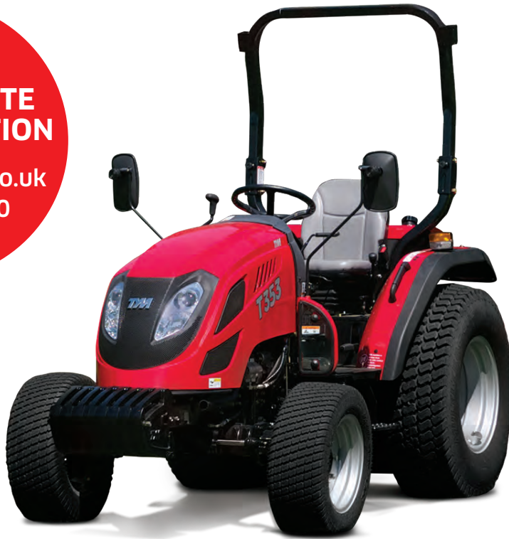
T353 SHOWN WITH TURF TYRES