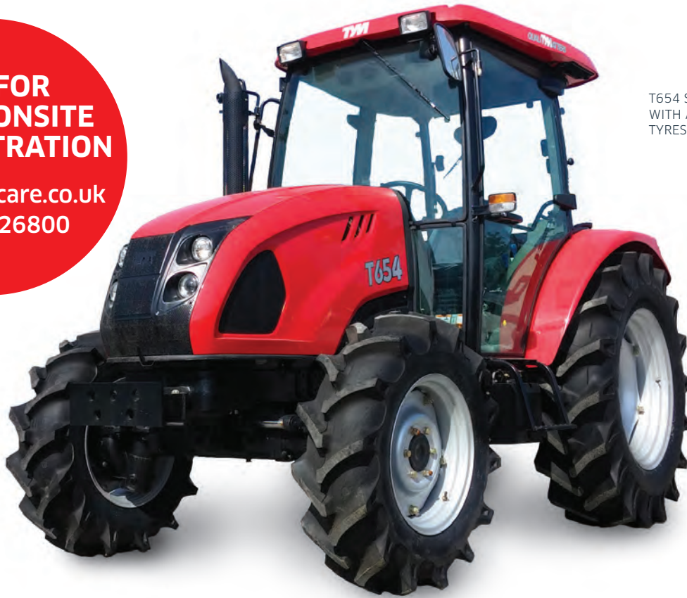
T654 SHOWN WITH AGRICULTURAL TYRES