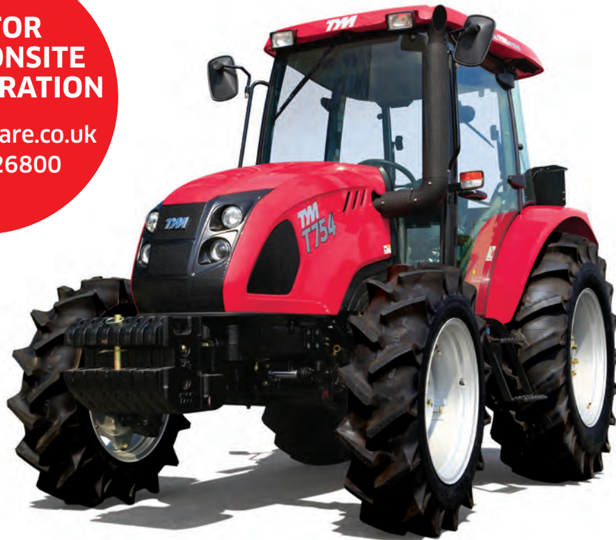
T754 SHOWN WITH AGRICULTURAL TYRES