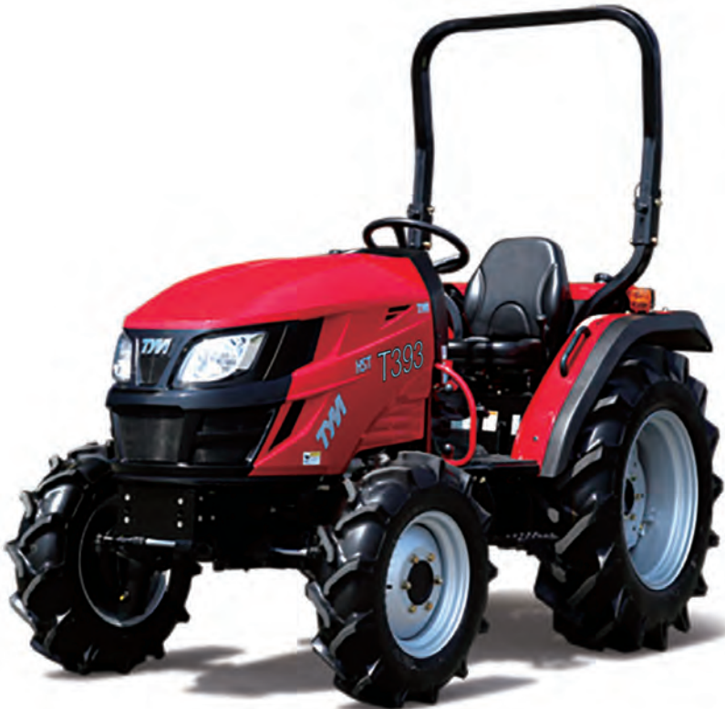
T393 SHOWN WITH AGRICULTURAL TYRES

The T393. The newest addition to the TYM range. If you are after a powerful compact tractor then test drive the T393. To cater for all needs, the T393 is available with either a manual or hydrostatic transmission. This new model features high capacity hydraulics, making it suitable for a wide range of tasks. In addition to the rollover protection system (ROPS) fitted as standard, this model can also be ordered with a factory fitted cabin equipped with air conditioning for comfort all-year-round.