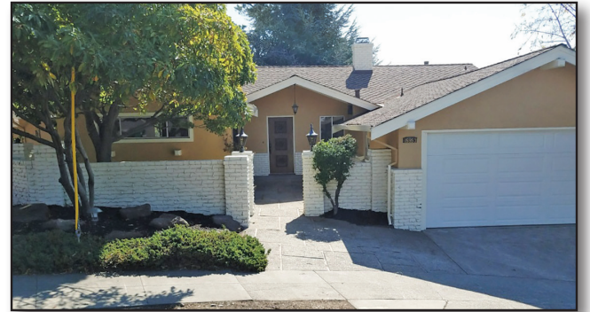
15950 Gramercy Dr., San Leandro • $799,000 Open Sat. & Sun., Oct. 14 & 15 from 1-4p.m.

Amazing Bay and Valley Views from this newly updated throughout 1,700 sq. ft. 3 bedroom, 2 bath family home situated on a .65 acre lot with 2 car garage, side access and off street parking. Situated in the hills of San Leandro, this homes features include a formal living and dining room with vaulted beamed ceilings, newly installed hardwood flooring, wall of windows, fireplace and slider to patio and yard. Eat-in kitchen with quartz counters, tile flooring, all new appliances and lighting. Master bedroom with large walk-in closet, master bath with granite counters, tile flooring, double sinks and stall shower. 2 additional bedrooms and hall bath with jetted tub, tile flooring and granite counter. Entertain, garden, relax or play in the oversized backyard with many fruit trees, plants and meandering paths. All this and so much more!