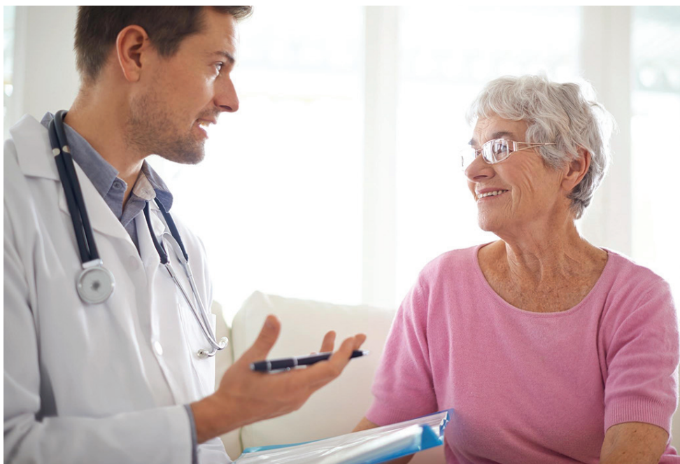
A LEADING CAUSE OF GLOBAL DEATH AND DISABILITY: When it comes to thrombosis, knowing the signs, symptoms and risk factors can help you keep life flowing.

The risk for VTE includes many factors: hospitalization, surgery, cancer, prolonged immobility, family history, estrogen-containing medications and pregnancy or recent birth.