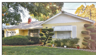
2 Bedrooms, 1.5 Baths, Offered at $599,000