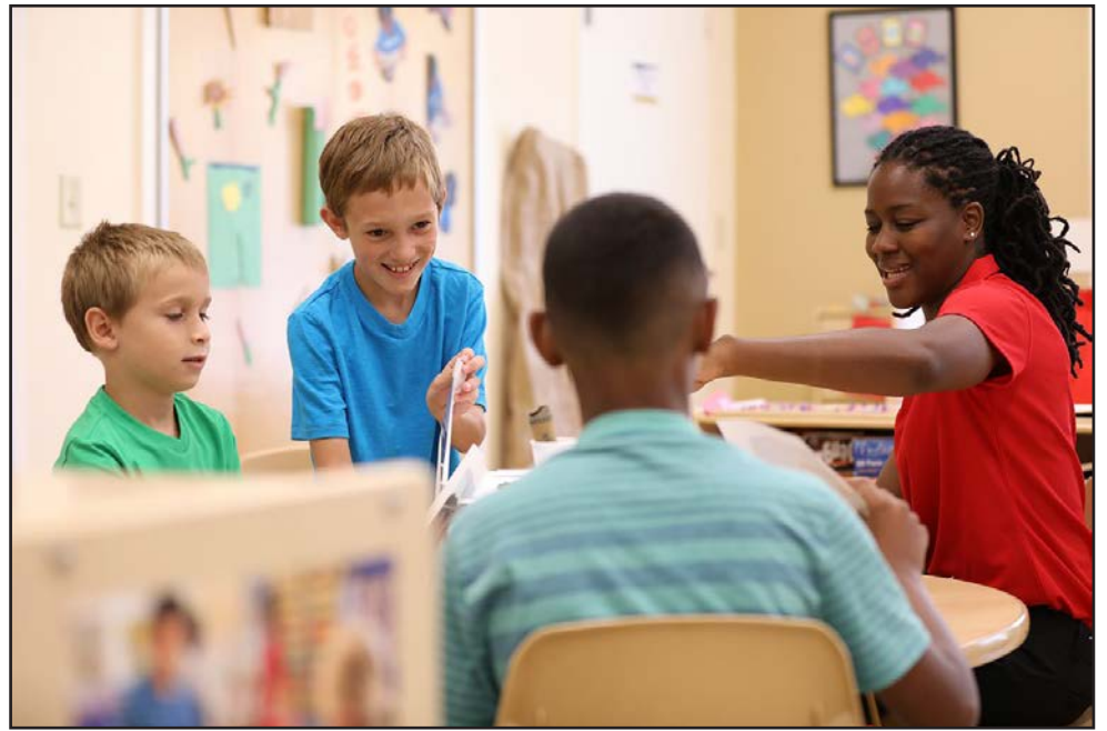
A survey says most parents believe academics aren't all they want their children to learn in school.

Sixty-two percent of parents in the survey responded that they prioritize their children learning soft skills like communication, critical thinking and problem solving before they're 8 years old, with 40 percent of parents saying that practical life skills are the most important thing for their children to learn at a young