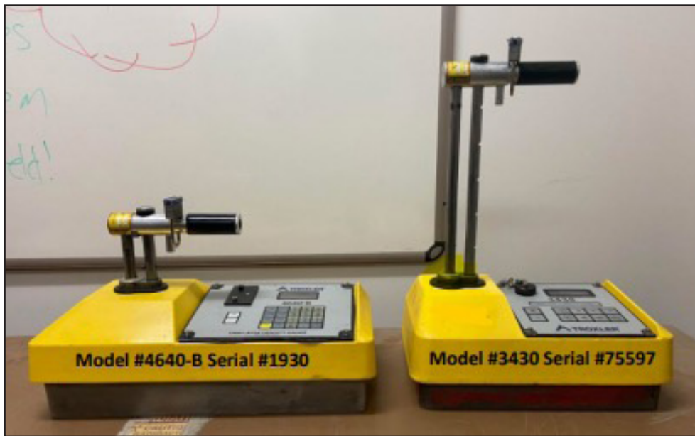
A pavement engineering company had these two gauges stolen from a truck in a restaurant parking lot on Marina Boulevard in San Leandro and they are offering a $500 reward for information for their return. The devices are of no value for any purpose other than paving.