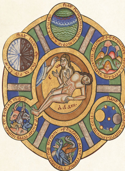
Detail, Anonymous, The Creation of the World , Germany, c.1170s

Desde el principio, al crearlos, Dios los hizo hombre y mujer.