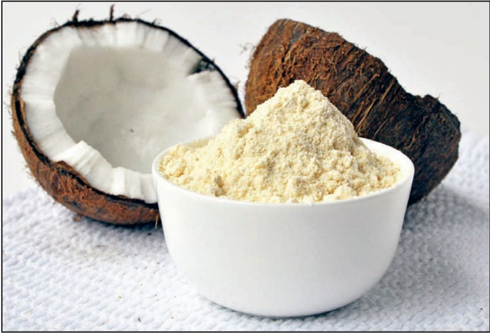
Coconut flour is made from dried coconut meat that has been finely ground to a powder. It is gluten-free, low in calories, and has other healthy attributes.

Flaked and shredded coconut, coconut milk, and coconut cream have been around for years, used in everything from tropical drinks to macaroons and pie. And lately, coconut water has made its way to the endless row of bottled waters on supermarket shelves. Now, add coconut flour. You may have seen it at your local grocers and thought it was just another novelty fad or “diet food” that will soon fade out of popularity.