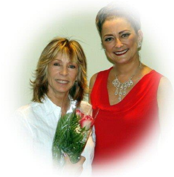
Juice Newton & Carol Curtis 10/5/06