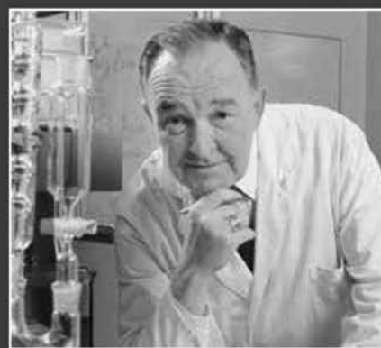
Dr. Paul Janssen, Founder

To support people living with mental health conditions and those who care about them