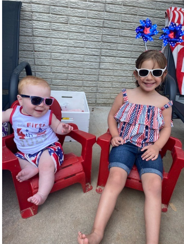
Celebrating the 4th of July in Style!