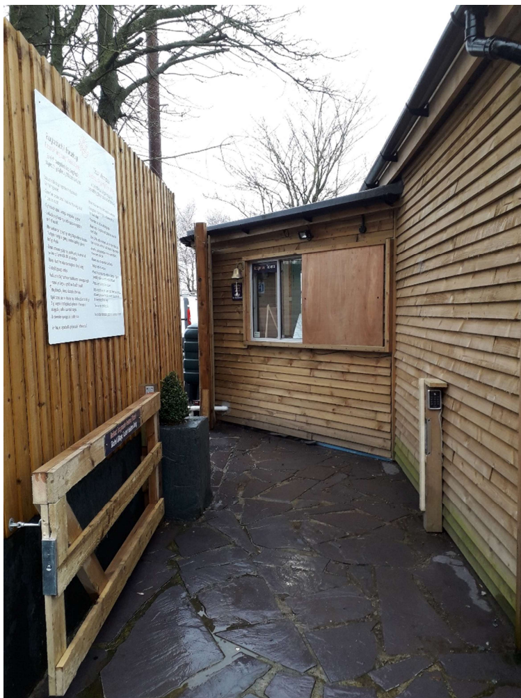
Gate entrance to Model Village from Ticket Office window