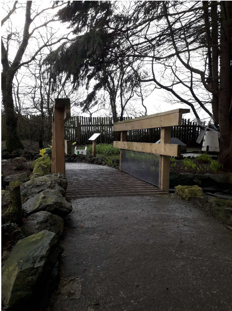
Pedestrian bridge in Model Village gardens