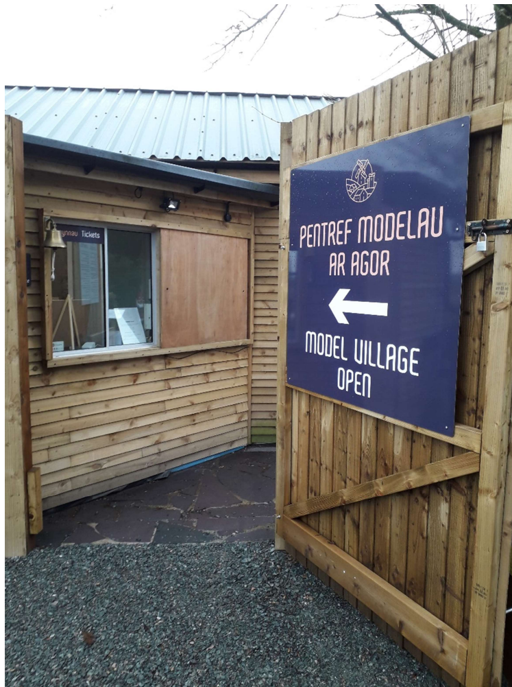
Entrance Gate to Ticket Office Window