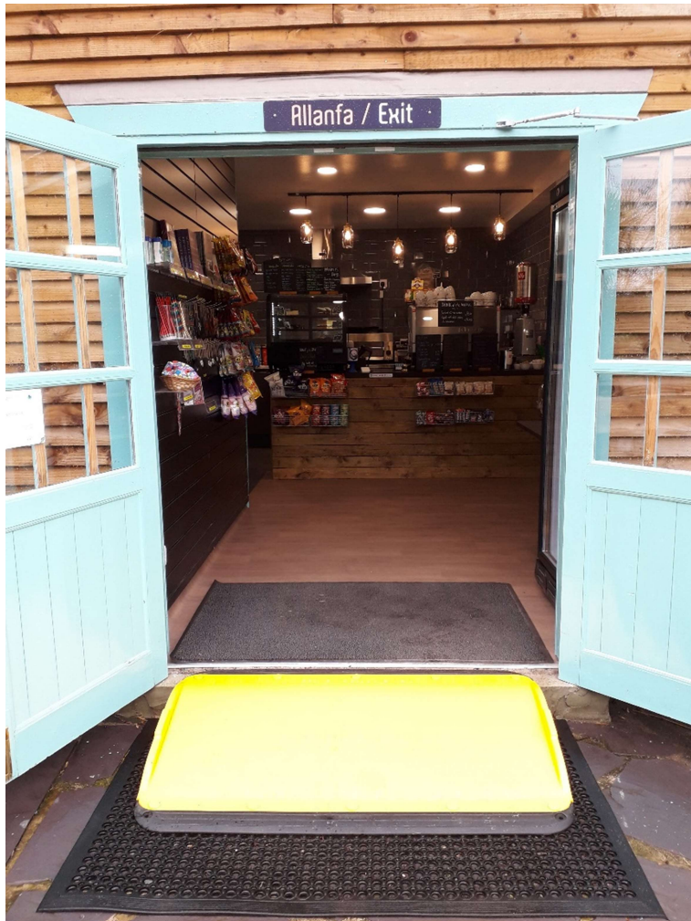
Entrance to Cafe from Model Village (with ramp deployed)