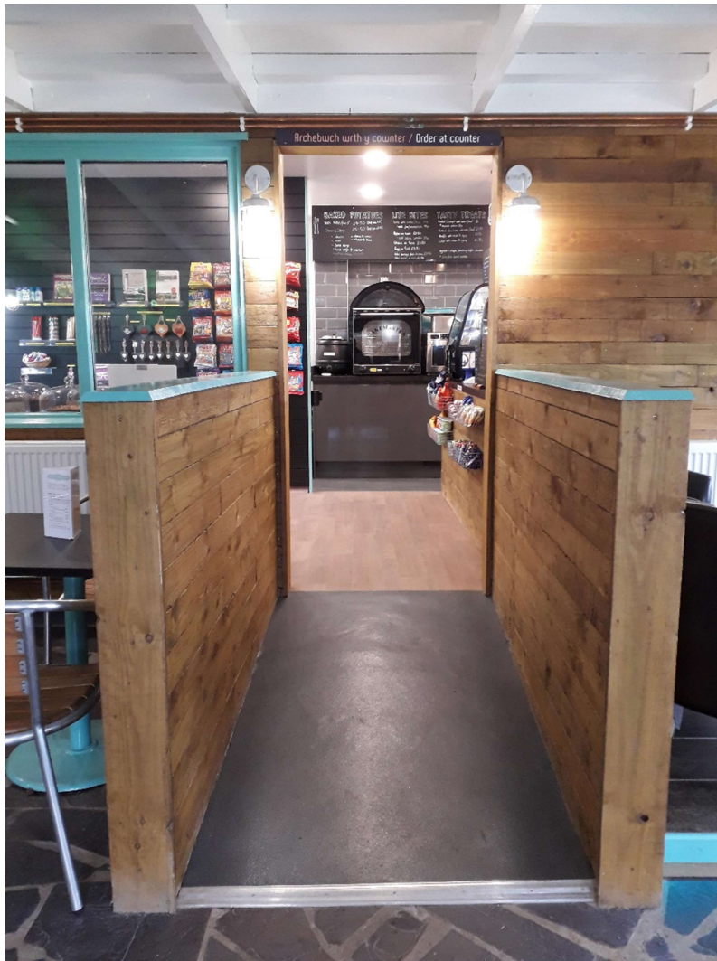
Fixed ramp within cafe