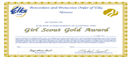
Girl Scout Gold Award