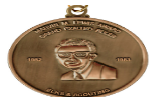
Marvin M. Lewis Scouting Award