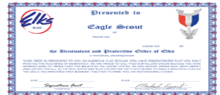
Eagle Scout certificate

Undergraduate Scholarship Program for Students with Disabilities – This scholarship program is a financial needs-based and academic-use scholarship. It is intended for undergraduate work at an accredited community college, four-year college, university, or licensed vocational school. The funds cover academic expenses only , which includes tuition, books, lab fees, and on-campus room and board. Since 1981 the Elks have provided financial assistance to students with severe disabilities wishing to further their education. An announcement will be made regarding the opening date for applications (Usually in November).