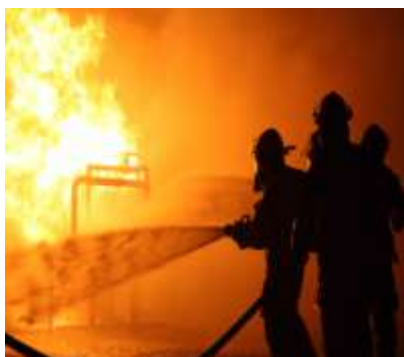
Fire Protection Equipment