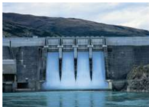
Hydro Electric Power Generation