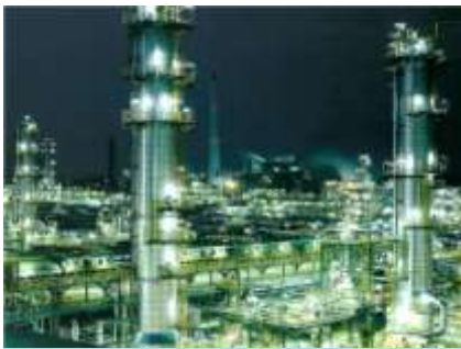
Petro Chemical Industry