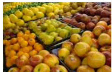
Farming & Agriculture