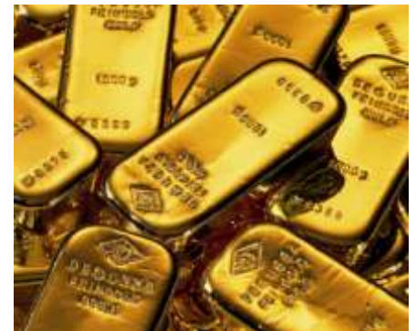
Precious Metals Industry