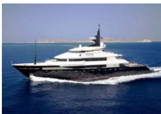
Luxury Motor Yachts