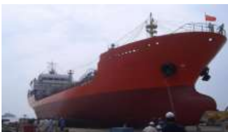
Ship Building Industry