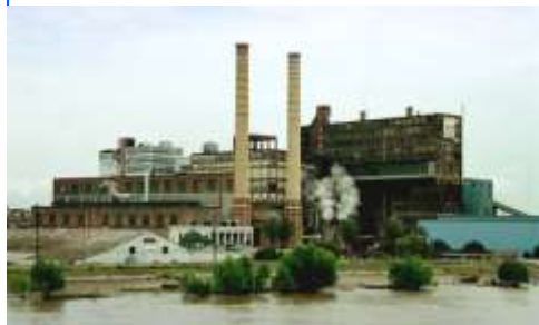
Sugar Industry & Refining