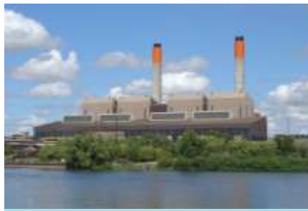
Coal Fired Power Generation