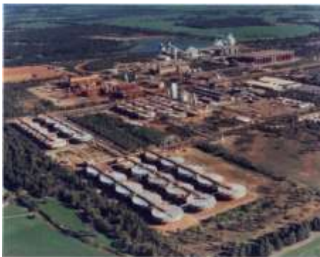
Bauxite Production Aluminum