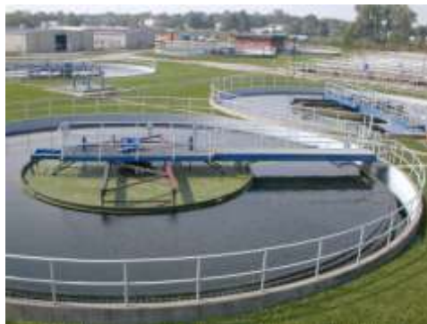
Water Treatment Plants