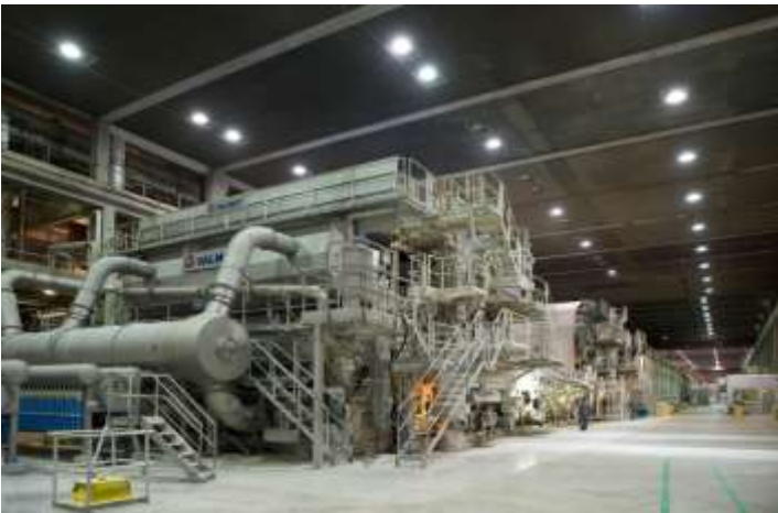
Pulp & Paper Manufacturing