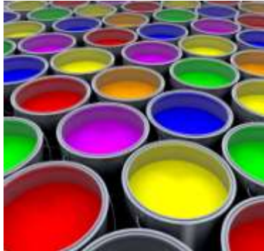
Paint & Ink Manufacture