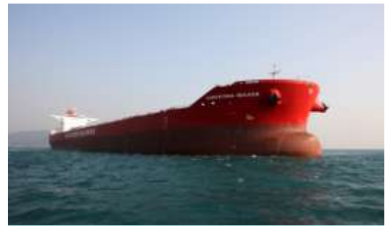
Bulk Carriers & Tankers