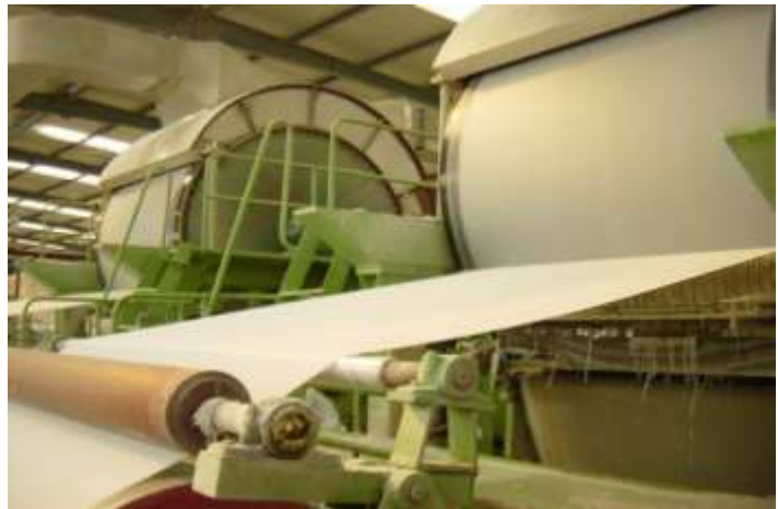
Paper Coating Industry