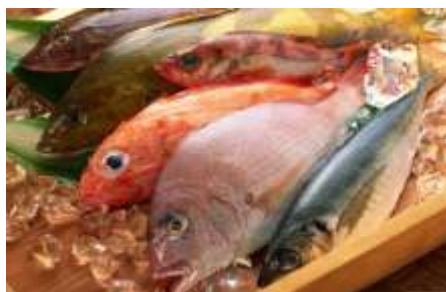
Seafood Processing Plants