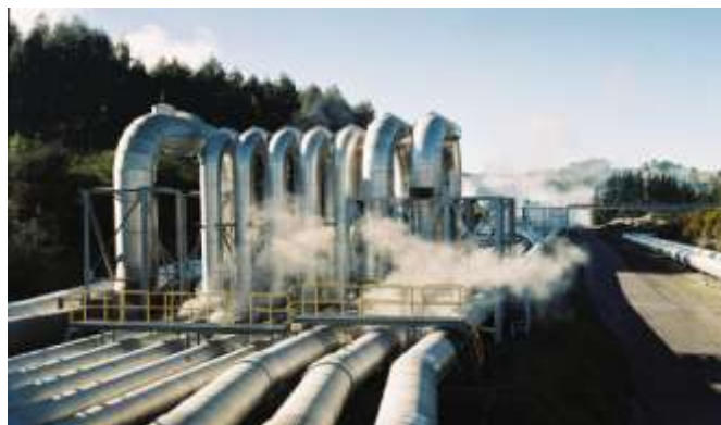
Geothermal Power Generation