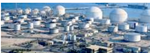
Fuel & Chemical Tank Farms