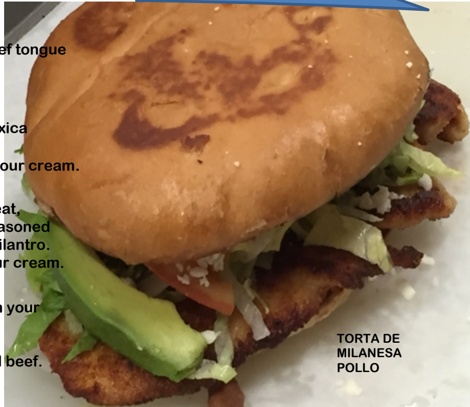
TORTA DE MILANESA POLLO

EXTRA $1.00 for lettuce, tomatoes, cheese or sour cream.