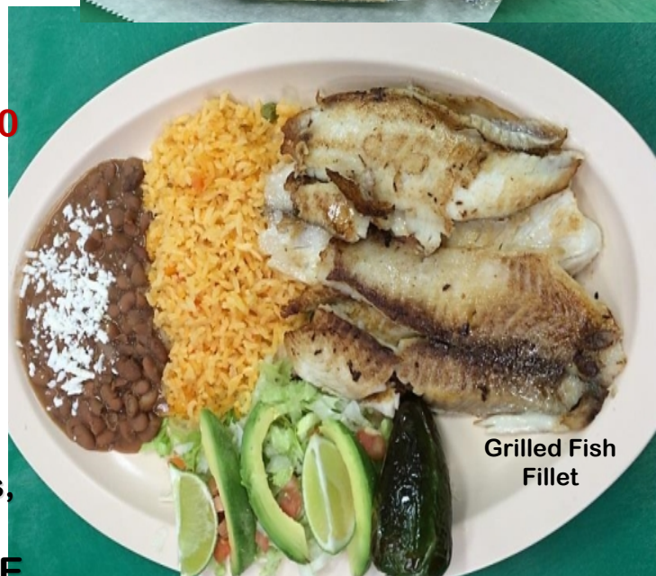
Grilled Fish Fillet