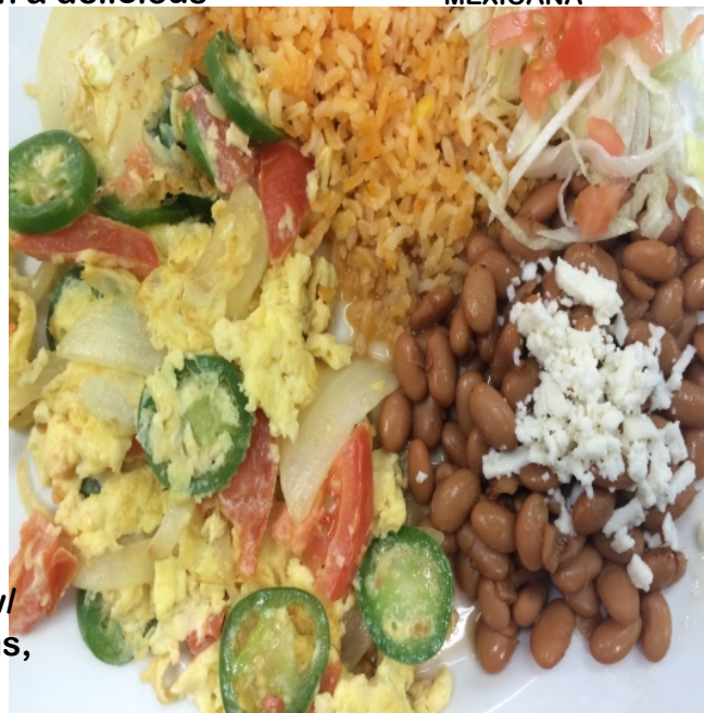
HUEVOS A LA MEXICANA

*Consuming raw or undercooked steak, seafood or eggs may increase your risk of foodborne illness, especially if you have a medical condition.