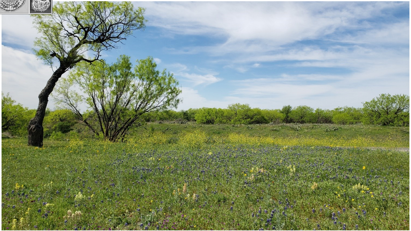
Texas roadside flowers

Great Basin Basketmakers 8175 S. Virginia St. #850 PMB 293 Reno, NV 89511