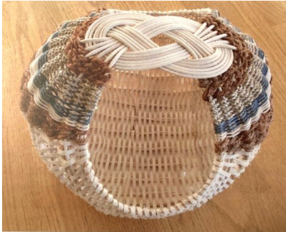
Dimensions: approximately 13" wide by 9" tall