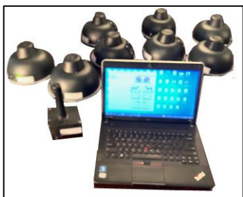
The Farmer Noah Demo System

If your organization can help us to bring the Farmer Noah O&M training concepts to fruition please contact us so we can provide more information: