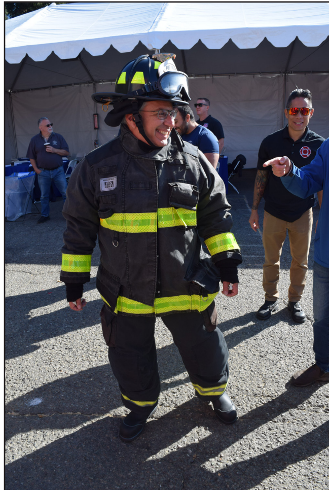
San Leandro Mayor Juan Gonzalez suited up as a firefighter for a day at the September 11 event held at the fire department's training facility at 890 Lola St. in San Leandro.