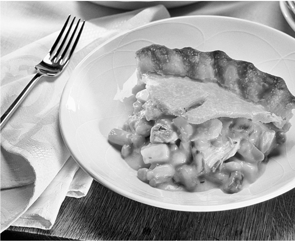
Chicken Pot Pie