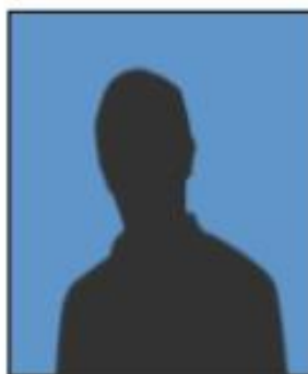
ABOVE - Picture of Contestant BELOW - Logo for Game Show