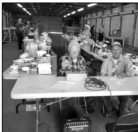
← The Silent Auction organized by Headwaters Chapter. A job well done!