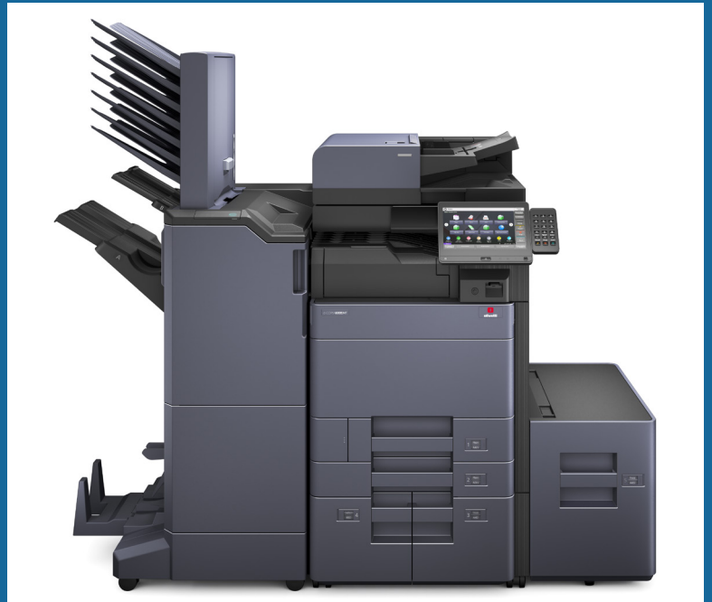
d-Copia 6001MF with DP-7110+PF-7110+PF-7120+DF-7110+BF-730+MT-730