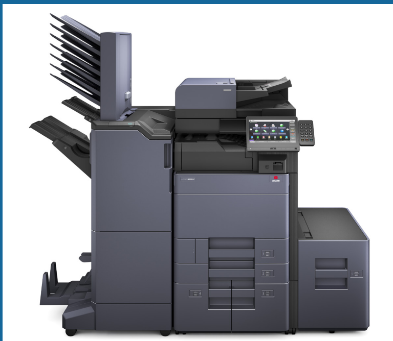
d-Copia 6001MF with DP-7110+PF-7110+PF-7120+DF-7110+BF-730+MT-730