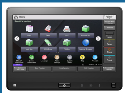
New 10.1" Touch-screen Operator Panel