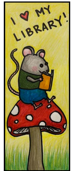
Louise Chau Adults 18+