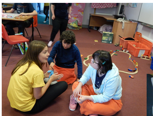
Time for some singing