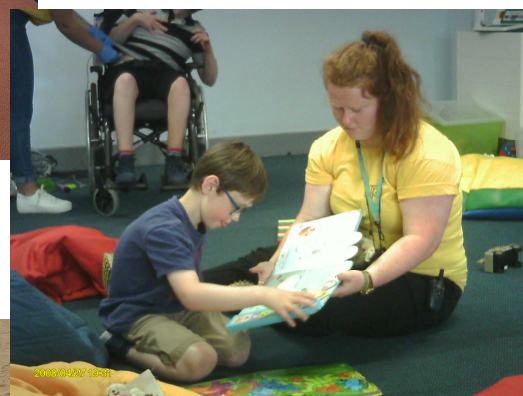
And a story....or two