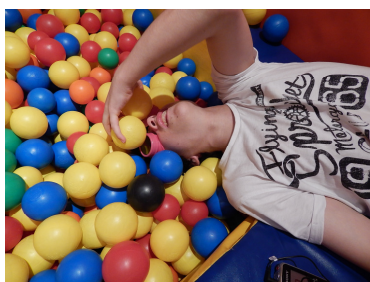
Some just wanted to chill