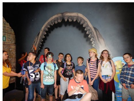
Fun at the Sea Life Centre