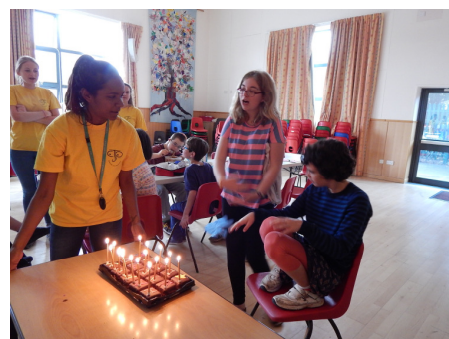
We celebrated birthdays too!