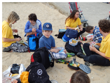
Enjoyable lunch on the beach at Great Yarmouth