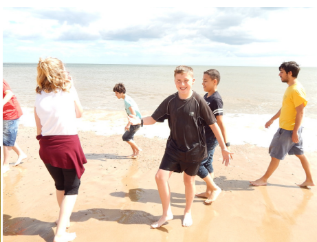
Time for a paddle before we set off to the Sea Life Centre