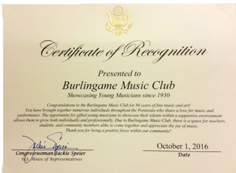
Certificate from Congresswoman Jackie Speier