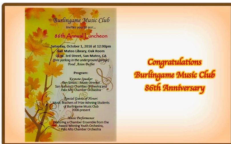
Invitation on Screen

More at http://www.burlingamemusicclub.net/Photos.htm